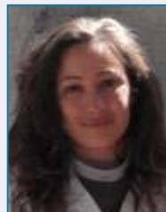
Nadine Di Donato Discussion Forum