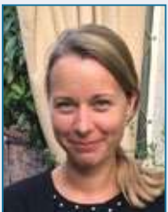
Pille Pargmae Videos