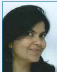
Suruchi Pandey Discussion Forum